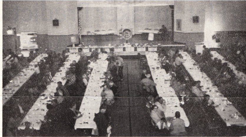
A lunch of roast beef, baked potatoes with all the trimmings was served by the Loring Women's Club at the annual meeting.