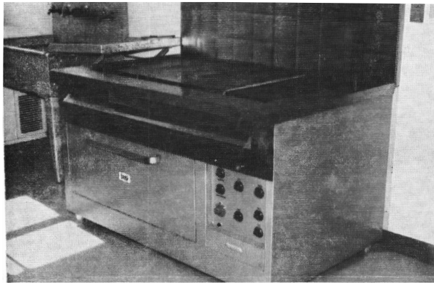
Large electric commercial ranges used in the Lodgepole and Hays Schools.