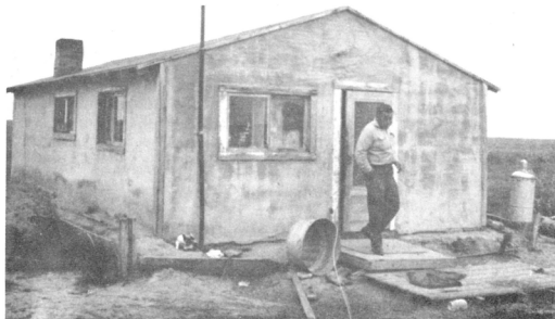
TYPICAL OF HOMES TO BE IMPROVED

The Big Flat Electric crew is at work on service lines to a number of homes constructed under another building program. This is known as the Mutual Help Housing Project. Nine homes are completed and 18 are under construction. Under the program applicants are approved for loans.