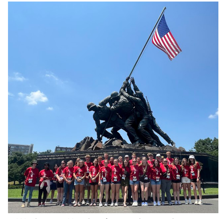
In 2024 there were 32 students from around Montana that went on the Youth Tour to Washington, D.C.

*All applicants have a chance to win $100 just for applying!