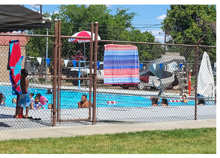
Harlem Pool Day was July 16.